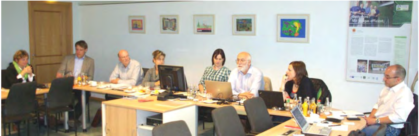
Members of the Working Group Deinking Process

Stora Enso Sachsen hosted the spring meeting of the INGEDE Working Group Deinking Process.