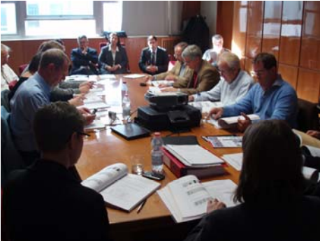
INTERGRAF meeting in Vicenza

INGEDE was invited to speak about recyclability of adhesive applications at the annual meeting of INTERGRAF's International Bookbinding and Print Finishing Section. Participants came from Austria, Belgium, Germany, Italy, Norway, Sweden, Switzerland and the